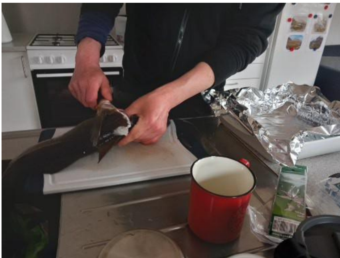
Fish fiesta. Fresh cod straight from the fjord.