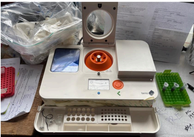
The portable benchtop Bento Lab with centrifuge and programmable PCR.