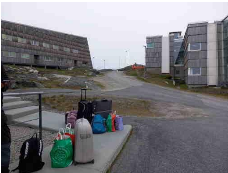
Leaving the University for Kobbefjord Research Station. Note the plastic bagsfull of food supplies. Because the Kobbefjord buildings were not located near the boat mooring site, a rucksack would have been more practical for transporting labware and other necessitated than a suitcase.

The electricity of the research station was mainly provided by solar panels. However, to meet the energy requirements of the laboratory equipment on rainy days, a gasoline-fueled generator had to be operated. During two nights the power was lost resulting in premature termination of the sequencing run. In addition, only refrigerator-temperature storage was available in Kobbefjord, rendering us with uncertainty of the functionality of library production enzymes, as during the longer-than-expected stopover in Reykjavik our enzyme transport cooler was thawed into room temperature.