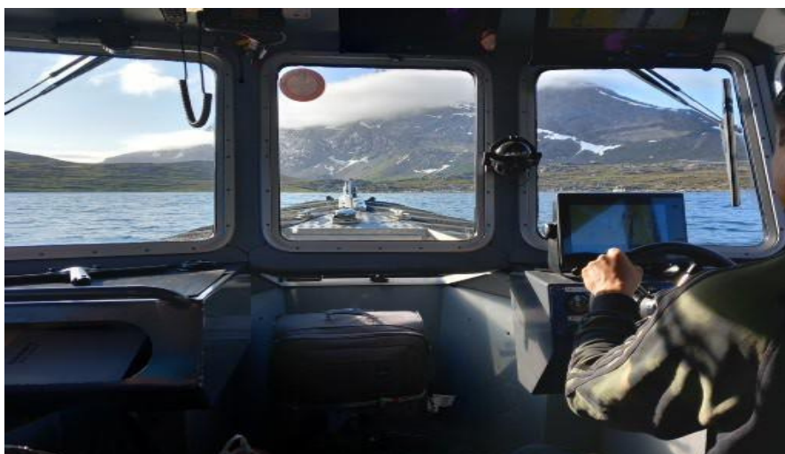
Boat arriving to Kobbefjord. Looking forward to spend time without internet or telephone.