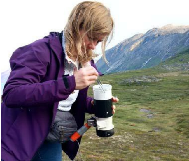
Sorting out mosquitoes from hundreds of blackflies.

During identification, we observed considerable morphological variation within larvae of Ochlerotatus nigripes , underlining the importance of rearing them to adults for accurate species identification. The second native mosquito species, Ochlerotatus impiger , was only observed in adult form due to differing developmental conditions.