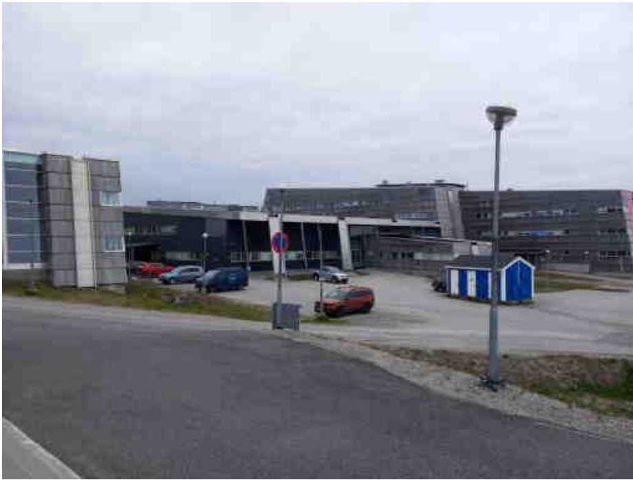
The University of Greenland in Nuuk.