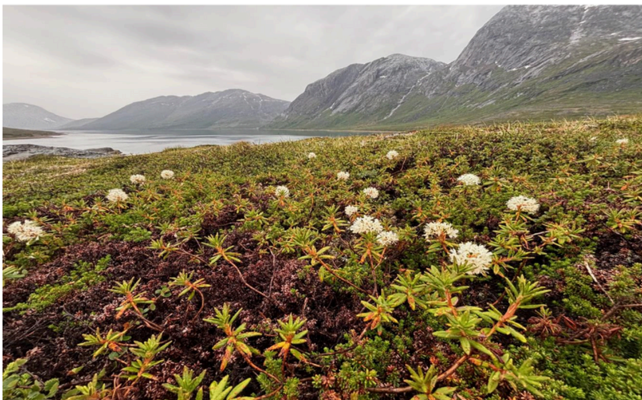
Arctic bog with Rhododendron groenlandicum .