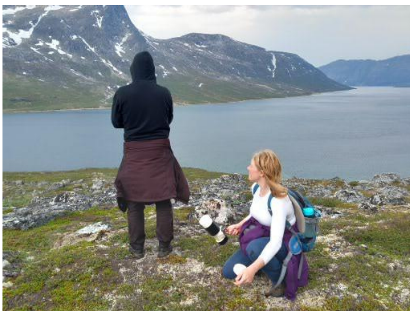
One of the sampling sites in Kobbefjord. Collecting adult mosquitoes with a vacuum-operated Prokopack aspirator.