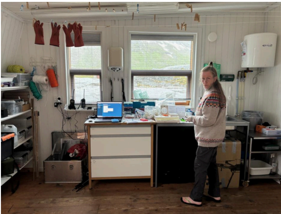
Everything works! Proud “lab rat” operating the mobile sequencing lab.