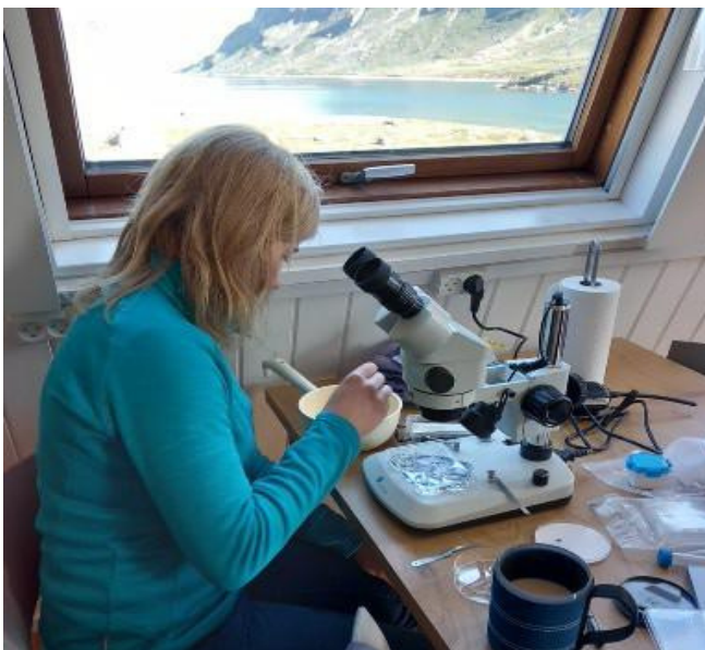
Kobbefjord. Species identification under the microscope.