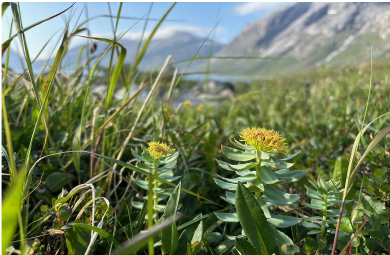
Enjoying the beauty of arctic nature and flora. Rhodiola rosea .