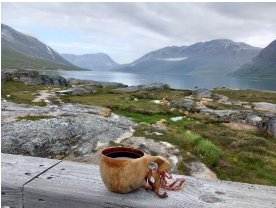
Morning coffee with a view over the fjord.

Kobbefjord resides in the end of the fjord and popular for day-trips. There are no other buildings outside the Research Station. The location is reachable by a 30-minute boat travel from Nuuk, approximately 25 kilometers in distance. During the weekend we saw many boats anchoring nearby, most probably enjoying fishing. As a hiking route starting from Nuuk goes near the Research Station, also hikers travelling on foot were observed. Despite the hours spent in lab we had a bunch of opportunities to enjoy the arctic nature and magnificent views nearby. The water of the fjord was unbelievably clear (and cold to swim in) and the tidal changes revealed seaweed, edible mussels and barnacles. Next time we have to remember to include garlic and other ingredients in the grocery list to enjoy moules marinière for dinner.