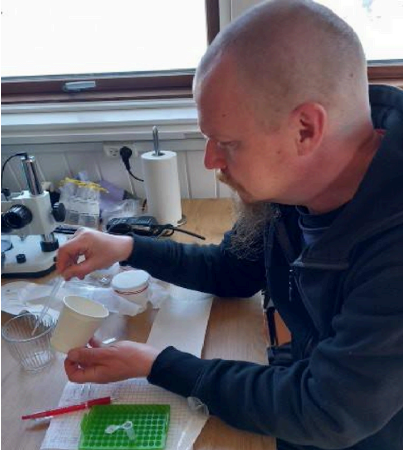
Pooling specimens for viral RNA extraction.

Three pools were included in each run, lasting 9-14 hours. Three runs contained premature stages and two runs adult mosquitoes, both Ochlerotetus nigripes and O. impiger . Despite the overnight room temperature stopover in Reykjavik, the enzymes used for library preparations worked at least decently. The MinION flow cells were washed after run using Nanopore flow cell wash kit, transported back to Helsinki, and re-used for shorter runs later.