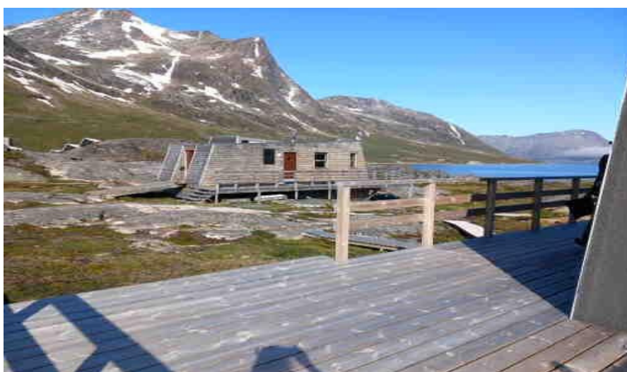
View from the dormitory building.