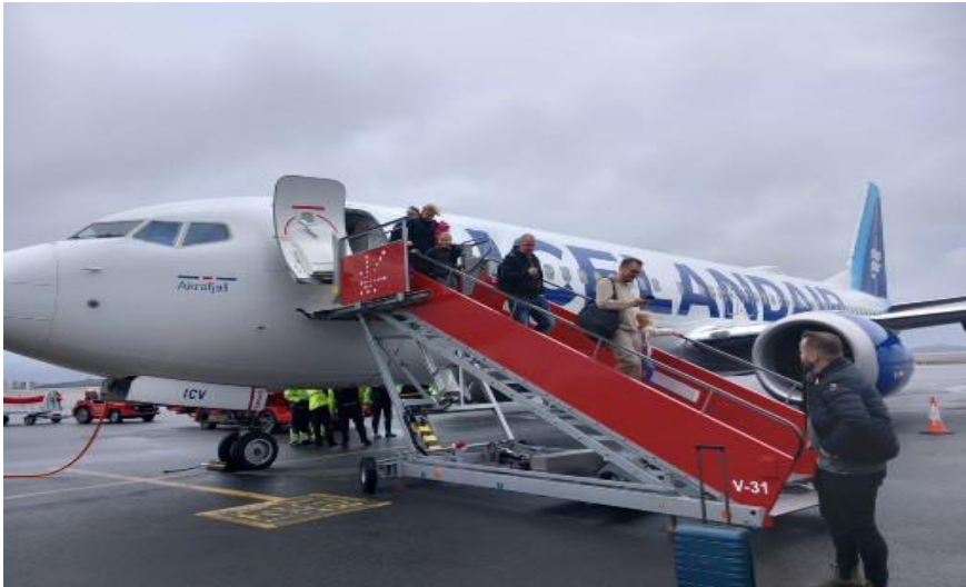
Arriving to Nuuk one day behind schedule.

Upon arrival in Nuuk, we spent one day preparing for the fieldwork in Kobbefjord, including shopping for grocery and collecting the first specimens. We also met with a local collaborator and reviewed his ongoing mosquito experiments, providing opportunities to discuss experimental design and share expertise.