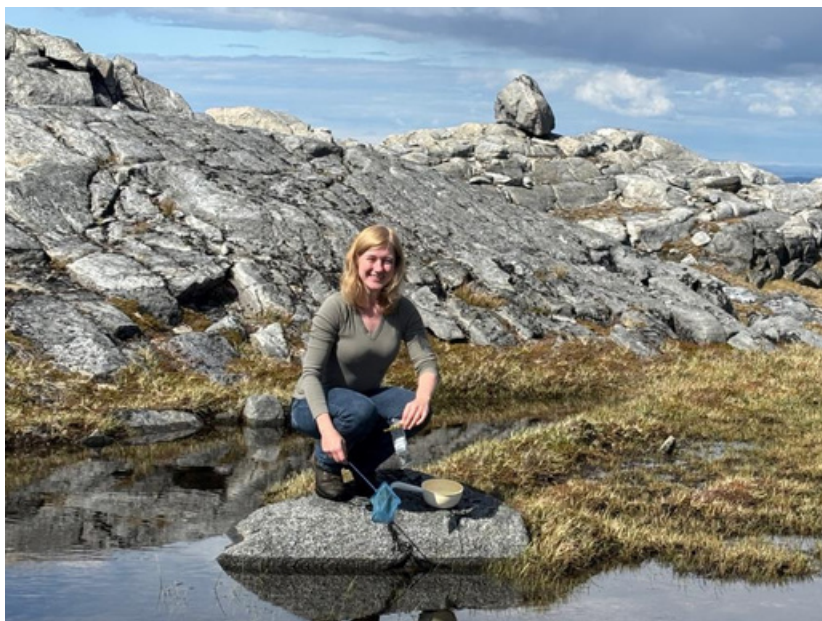
Sampling site near Nuuk. As one field day was lost, a day-trip was made to find mosquito premature stages for sequencing in Kobbefjord. The mosquito expert catching the research specimens in the puddles with a scoop and net.

As the mosquito season had not fully started, the project scope was expanded to include both larval and adult samples . Since one field day was lost due to flight cancellation, the immature stages were collected at a location near Nuuk (Kuanninnguit) on the day before the transportation to Kobbefjord. Scoops and nets were used in collecting larvae and pupae in puddles. At Kobbefjord Research Station, adult mosquitoes were sampled using Prokopack aspirators, however, as the mosquito season was delayed, more blackflies than mosquitoes were caught. Logistical challenges arose due to the absence of ethyl acetate and the lack of freezer facilities at Kobbefjord, complicating the processing of adult specimens.